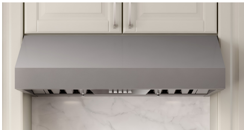
30" model shown