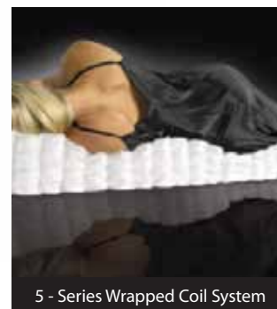
5 - Series Wrapped Coil System

Adjustable Base & BodyLogic™ Lifestyle friendly