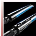
Stainless Steel Dual-Tube™ Burner System