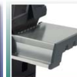
Stainless Steel Drop-Down Side Shelves