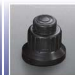
Sure-Lite™ Electronic Ignition System