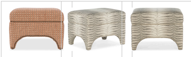
Fabric shown: 600394-17 (no longer available) Nails: Brass