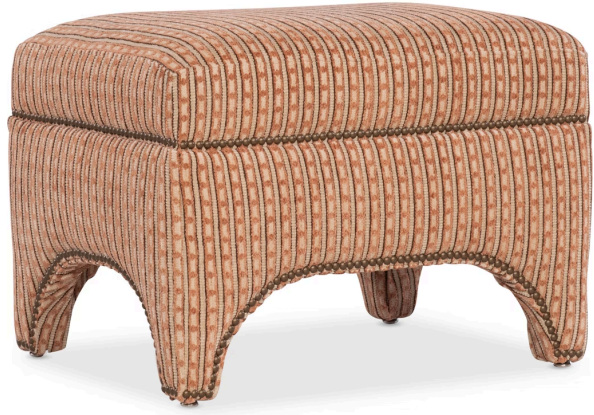
Fabric shown: 600394-17 (no longer available) Nails: Brass