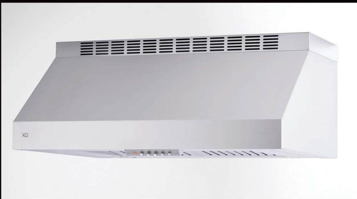
Wall Mount Hood