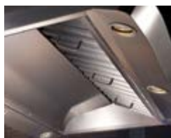
Pro-Style Hi-Flow™ baffle filters with easy to clean bottom panel and halogen lighting.