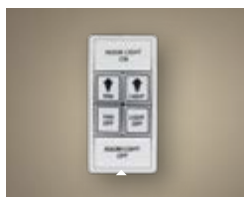
The optional LinkLogic® Remote Control can be installed in any single-gang electrical box; features pushbutton switches for the lighting control that previously occupied the space.