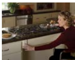
Optional remote LinkLogic® Control makes access convenient.