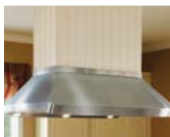
Drywall finish trim kit allows for unique design applications.