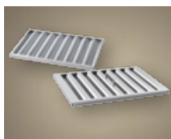
Hi-Flow™ baffle filters utilize a V-mesh & baffle design to increase airflow, lower sound levels and provide excellent ventilation efficiency.