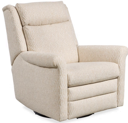
Fabric shown: 700192-07