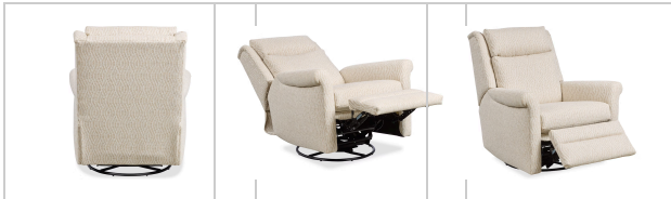
Fabric shown: 700192-07