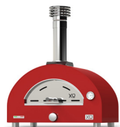
Red Powder Coat