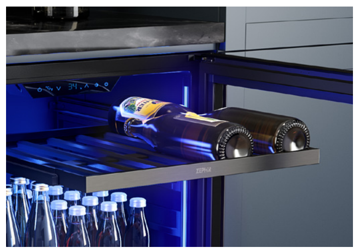
Full-Extension Wood Rack