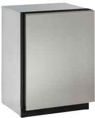
INTEGRATED SOLID (STAINLESS HANDLELESS PANEL)*