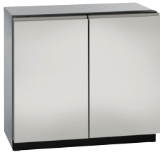
INTEGRATED SOLID (STAINLESS HANDLELESS PANEL)*