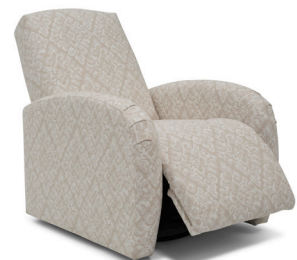
Shown in Fabric