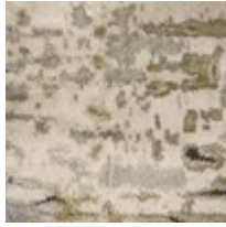
Pillow Fabric: 1-20" x 20" Pillow 8414-17CC