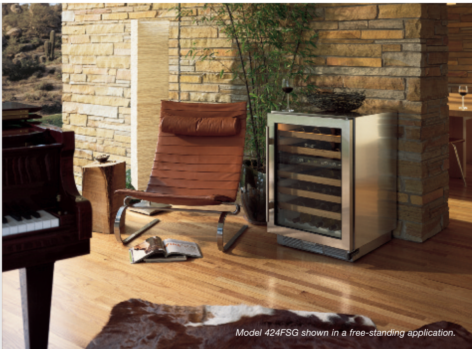
Model 424FSG shown in a free-standing application.

Better wine storage conditions for the bottle ultimately means better enjoyment in the glass. Free-standing model 424FSG has a wine storage capacity of 46 (750 ml) bottles. Two independent storage zones maintain the temperature and humidity that wine — and wine lovers — require. The exterior is completely clad in stainless steel for a free-standing application.