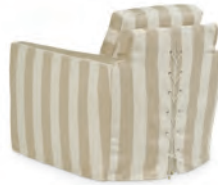
Back view of Slipcover