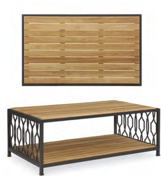
D36-86 Palladian Cocktail Table W 50 D 30 H 18.5 Natural Teak with Powder Coated Aluminum Soft Iron frame finish