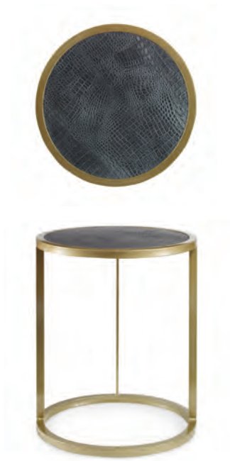
D36-84C Halo Accent Table with Croc Insert W 20 D 20 H 24 Antique Brass finish | Powder Coated Aluminum Textured cast composite top