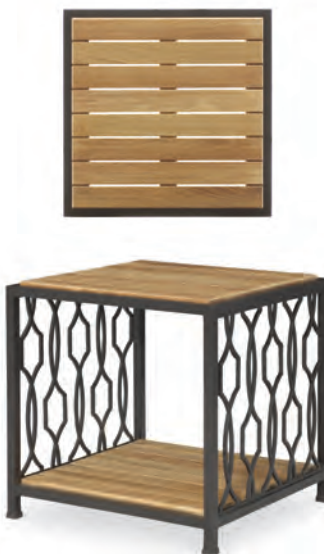
D36-82 Palladian Side Table W 24 D 24 H 24.5 Natural Teak with Powder Coated Aluminum Soft Iron frame finish