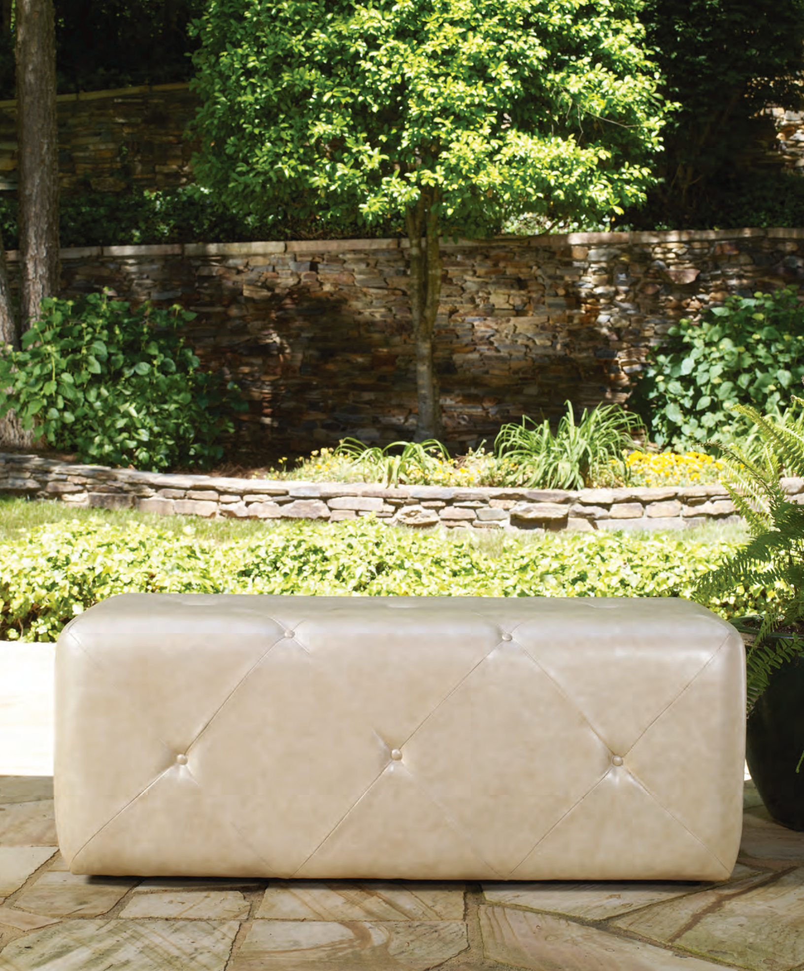
Shown above: D36-46 Trove Bench