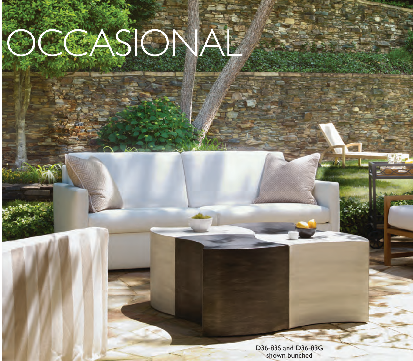
D36-83S and D36-83G shown bunched