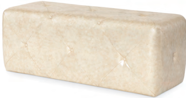
D36-46 Trove Bench W 49 D 19 H 19 Sandstone Pearlized frame finish Cast composite