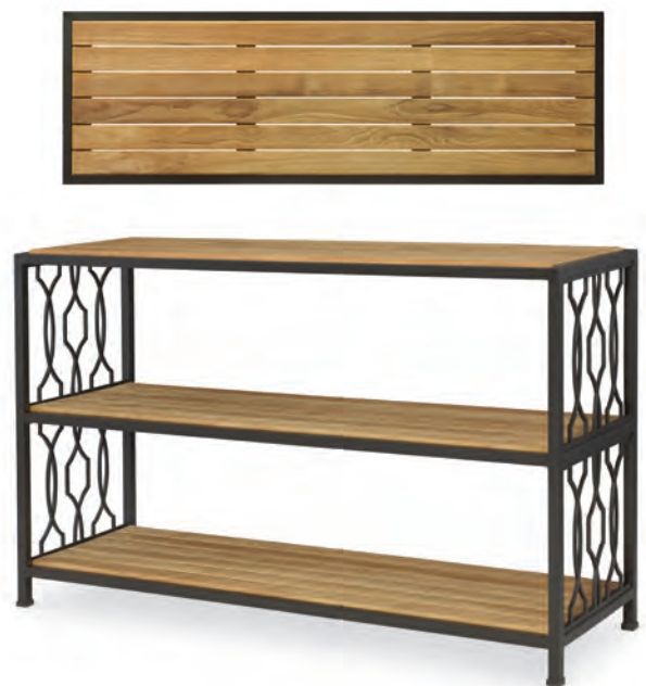
D36-87 Palladian Console Table W 56 D 18 H 34.75 Natural Teak with Powder Coated Aluminum Soft Iron frame finish