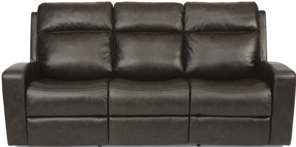
1820-62PH in 297-02