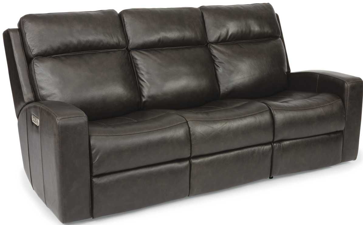
1820-62PH in 297-02