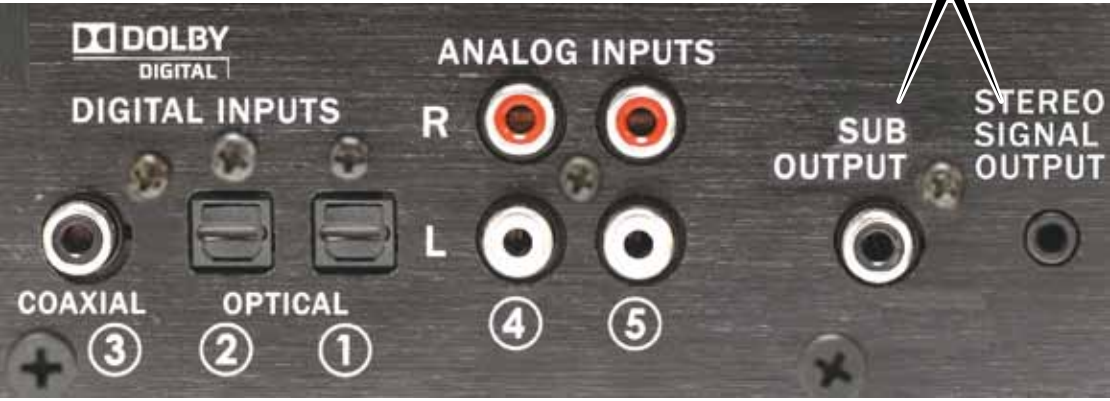
SoundBase Back Panel Inputs and Outputs