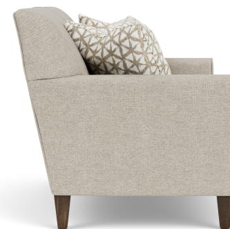
5966-20 in Fabric 818-01