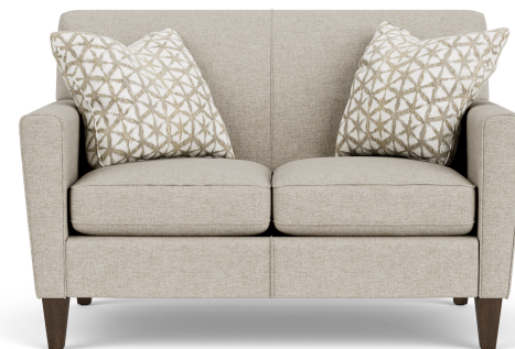
5966-20 in Fabric 818-01