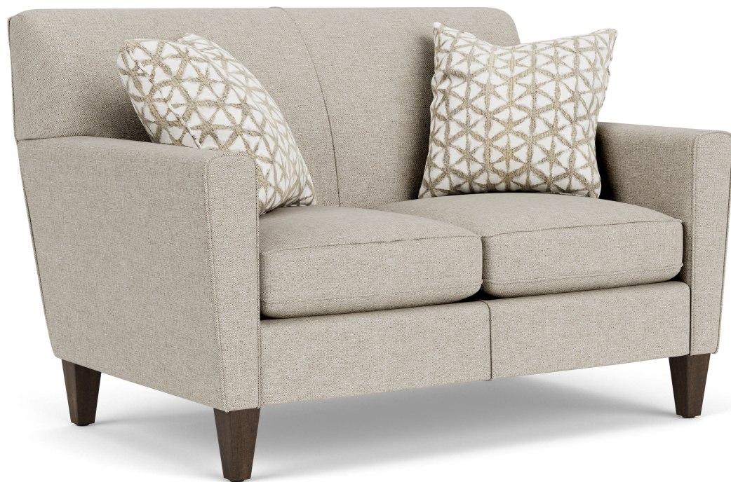
5966-20 in Fabric 818-01