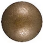
Nail Color: Natural