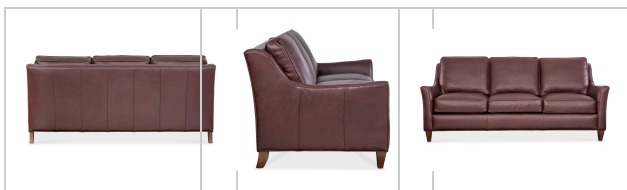
Leather shown: 927400-58 Finish shown: New Classiques