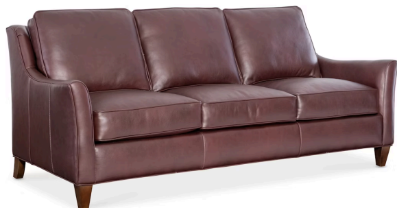
Leather shown: 927400-58 Finish shown: New Classiques