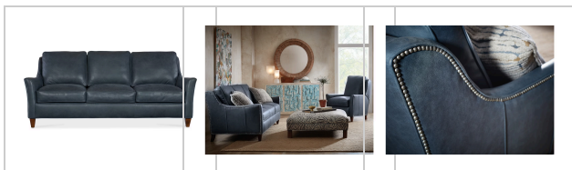
Leather shown: 926800-48 Finish shown: New Classiques Pewter Nails