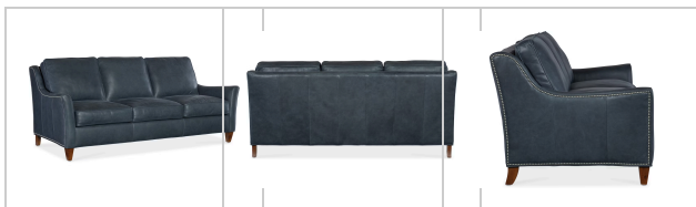
Leather shown: 926800-48 Finish shown: New Classiques Pewter Nails