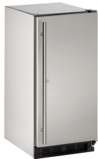
STAINLESS SOLID (LOCK)