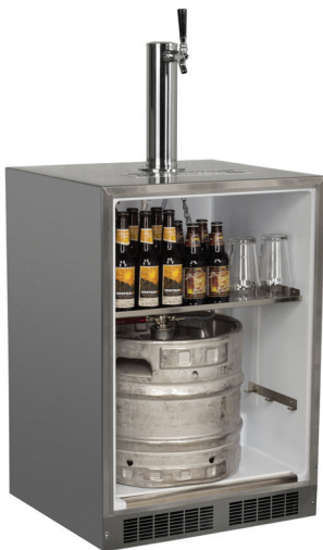
Tall Quarter Barrel or Pony Keg with Beverage Storage

Double-insulated tower reduces foam on pour and prevents condensation