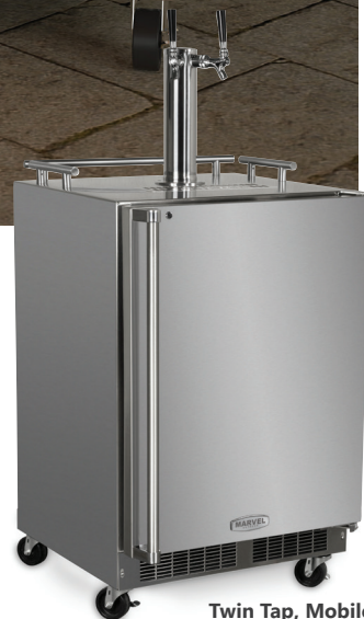
Twin Tap, Mobile