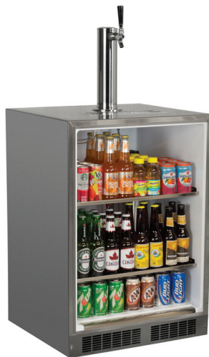
Full Beverage Storage