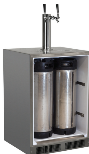
Two Sixth Barrels or Cornelius Kegs