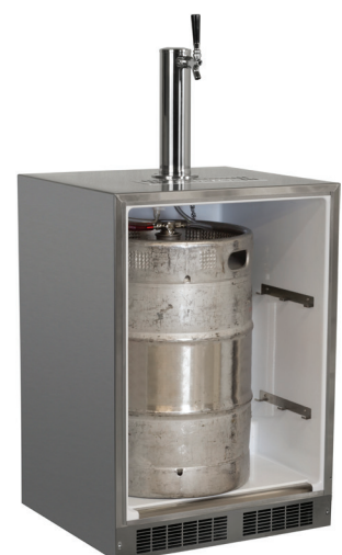
Half Barrel or Slim Quarter