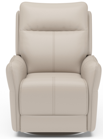
1504-52PH in Leather 050-01