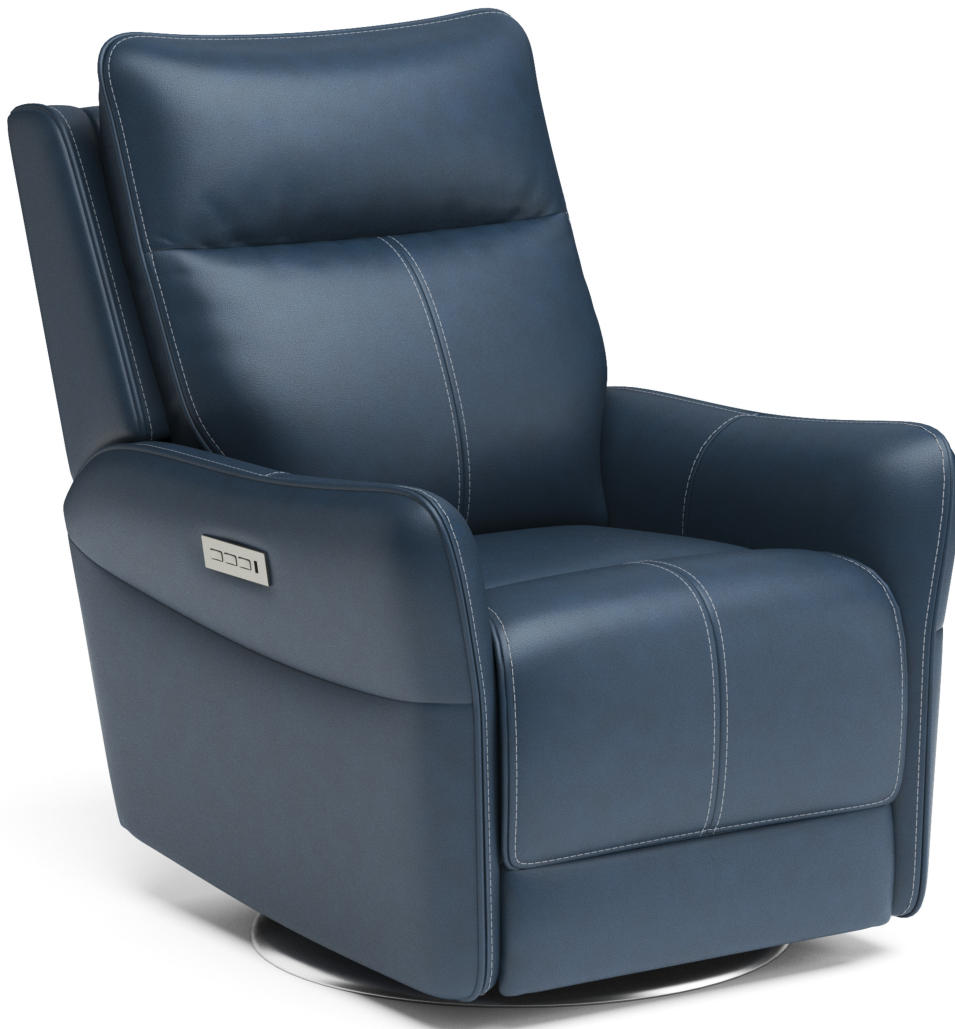
1504-52PH in Leather 050-40