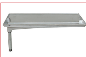
Cast Aluminum Drip Tray Shields food from direct contact with flame reducing flare-ups and providing consistent heat