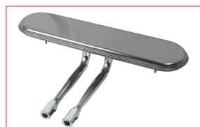
Stainless Steel Dual Burner Provides precise heat and infinite settings