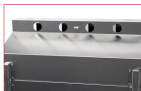
Vents with Damper Slide For added heat retention in cold and/or windy weather