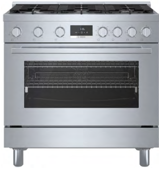
HDS8655U Stainless Steel