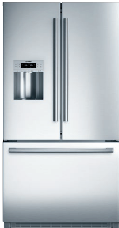
B26FT70SNS Stainless Steel

The standard-depth French Door refrigerator offers large storage capacity and keeps your produce fresh longer.