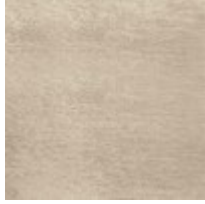
Soft Silver Leaf