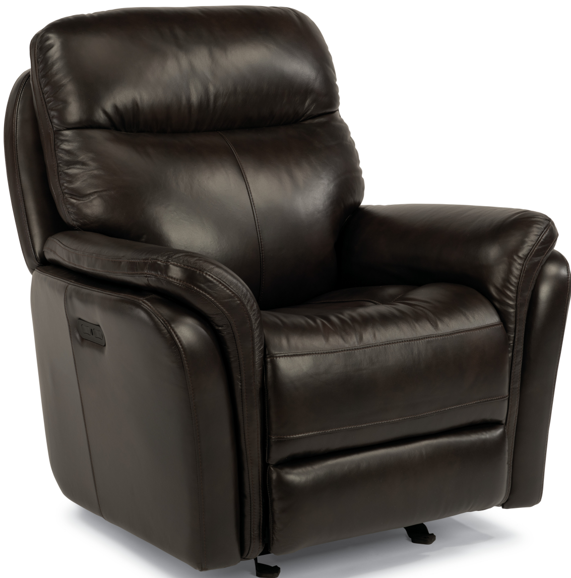
Power Gliding Recliner with Power Headrests 1653-54PH in 360-70