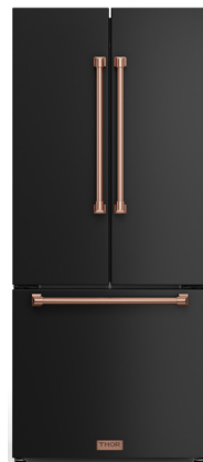
ROSE GOLD RF3017FFD00-RSG