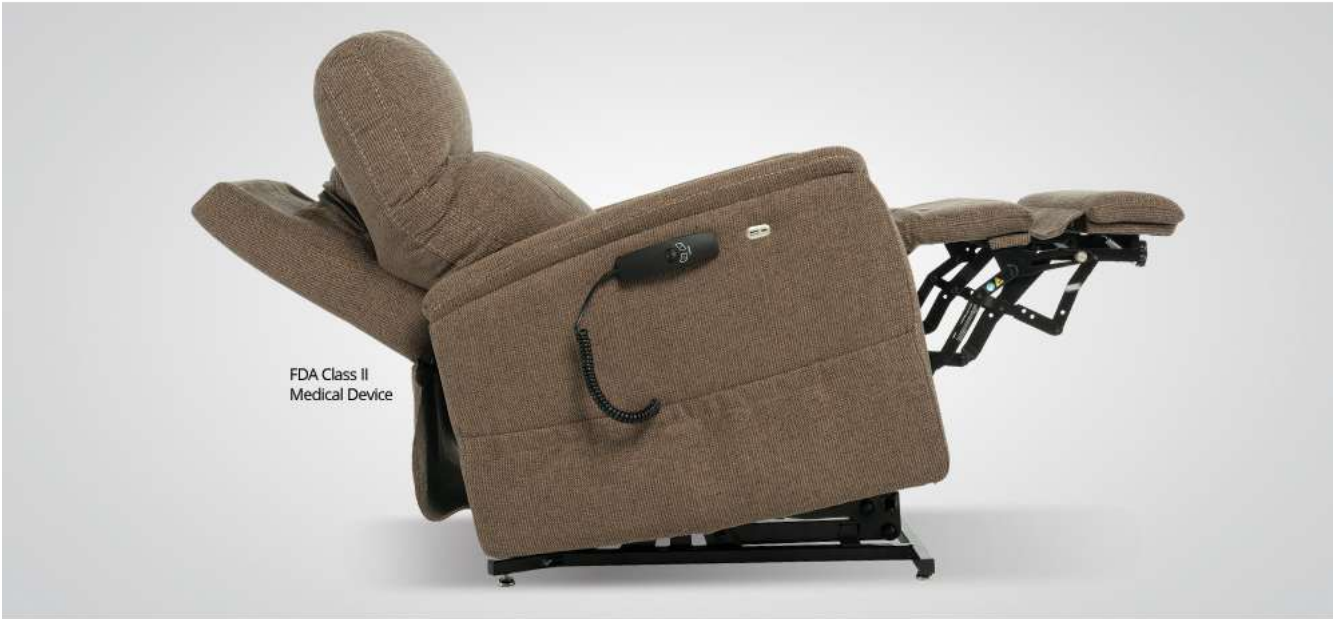
FDA Class II Medical Device