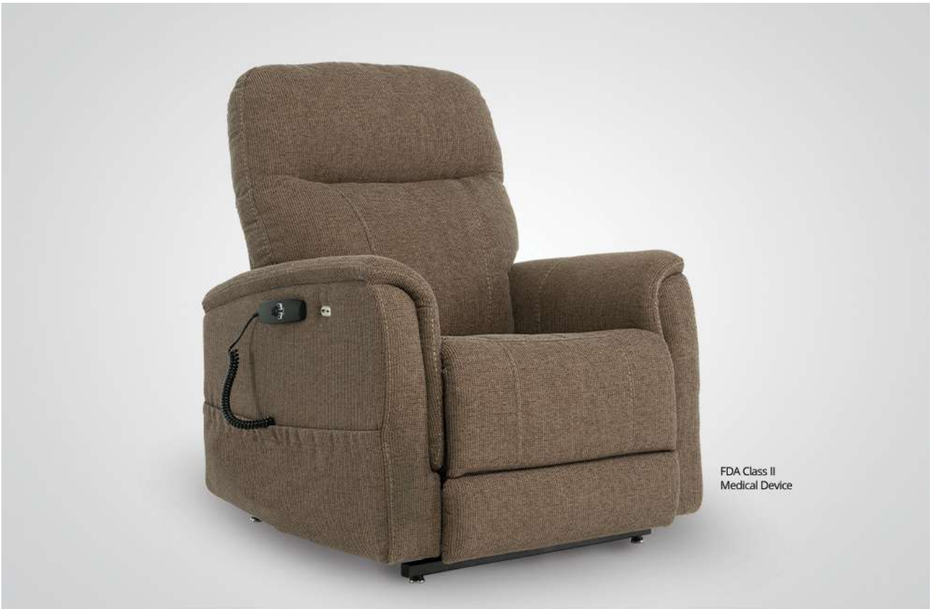
FDA Class II Medical Device