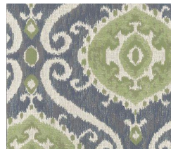
4553 Adorn in 003 Meadow