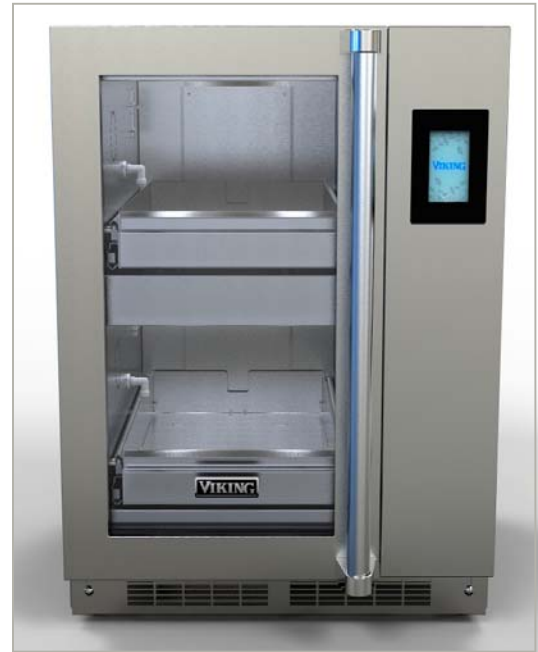
GCV12LSS (left hinged door)