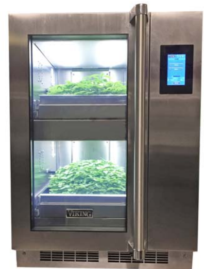
GCV12LSS (left hinged door)