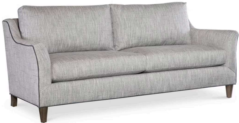
Fabric shown: 407600-49 Finish shown: Cobblestone