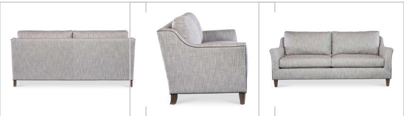
Fabric shown: 407600-49 Fabric shown: 407600-49 Fabric shown: 407600-49 Finish shown: Cobblestone Finish shown: Cobblestone Finish shown: Cobblestone