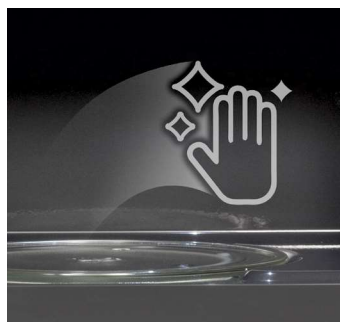
The gray interior adds an elegant touch to your modern kitchen