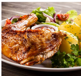
Generous, 1.4 cu. ft.* oven makes it easy to reheat larger dishes

The powerful, 2-speed ventilation system is effective up to 300 cu. ft. per minute (300 CFM) and can be configured to ducted venting or ductless recirculation. The SMO1461GS also features easy-to-reach, easy-to-replace charcoal, and grease filters. With decades of experience designing innovative cooking appliances, it's easy to see why cooks around the world trust Sharp.