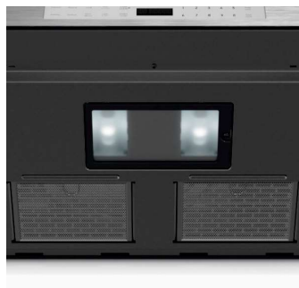
Easy-to-access, sliding grease filters allow for effortless, hassle-free replacement