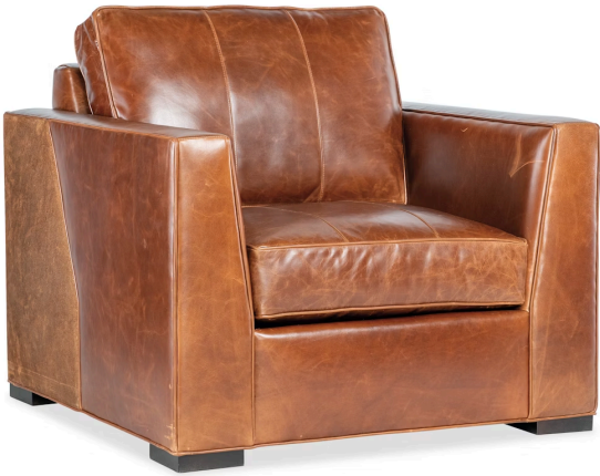
Leather shown: 928000-86 Finish: Plantation