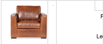
Leather shown: 928000-86