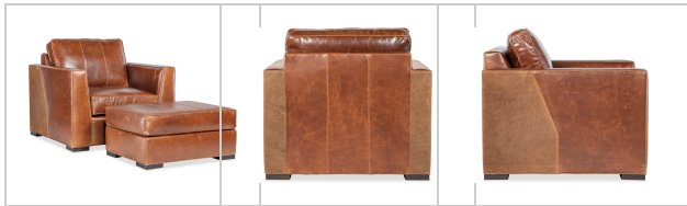
Leather shown: 928000-86