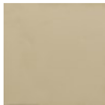
Whisper of Gold