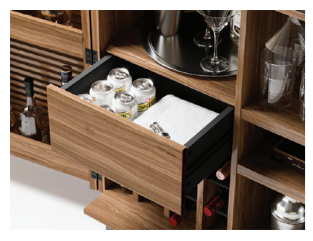
Storage drawer provides a home for utensils, mixers, and other supplies