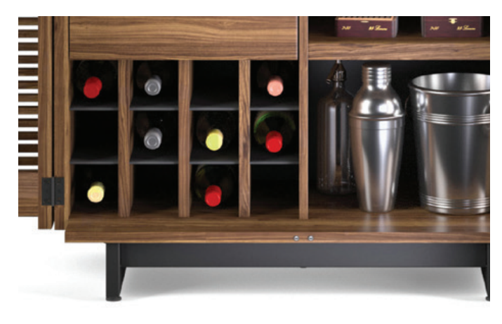
Storage for up to 12 wine bottles