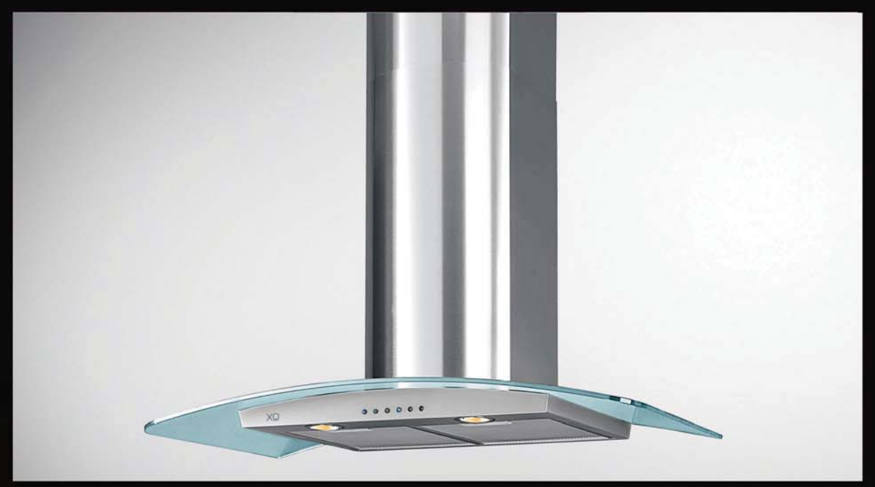
Wall Mount Hood