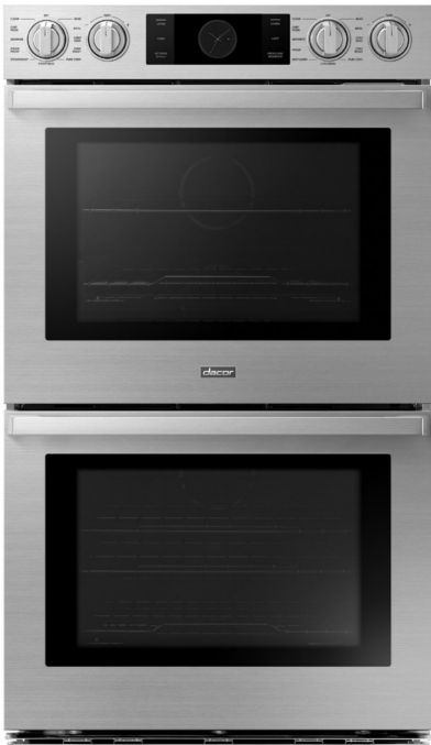
DOB30T977DS/DA - Silver Stainless