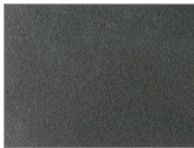
Graphite Txt PC