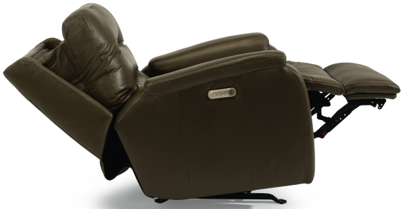
3810-51L in leather 824-74