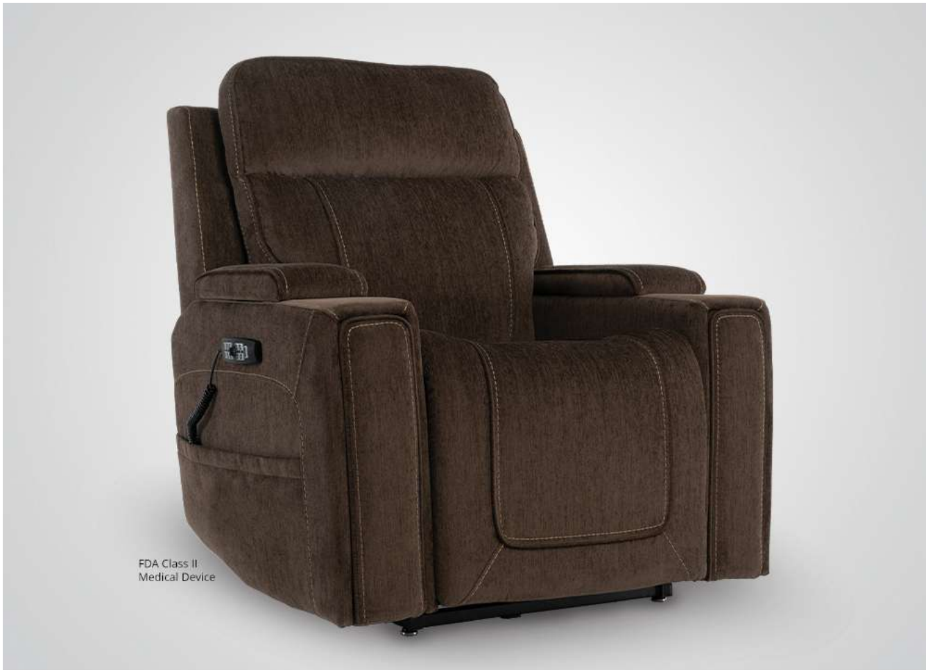
FDA Class II Medical Device