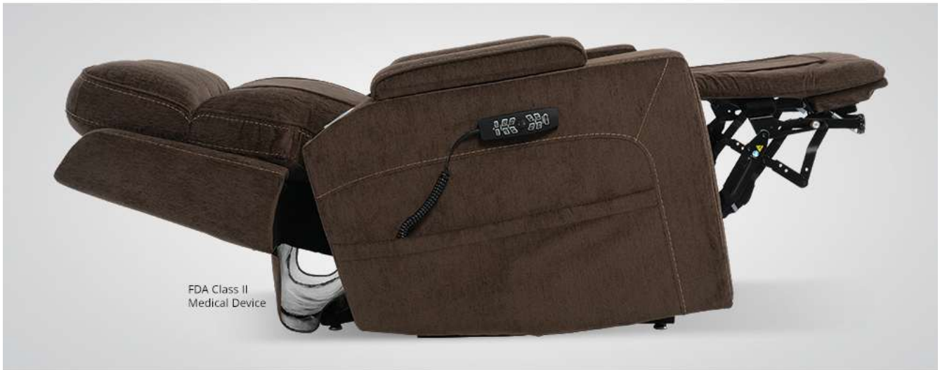
FDA Class II Medical Device