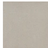
Soft Silver Paint