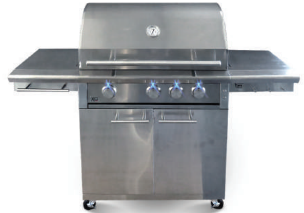
XOGRILL32XLT & CART

Family. Good friends. Great food. The sizzle and sear of your XO grill on a warm summer evening. These are the building blocks of memories. That's why our premium appliance experience and the learning from over 25 years of working with customers has gone into the design of every XO grill.