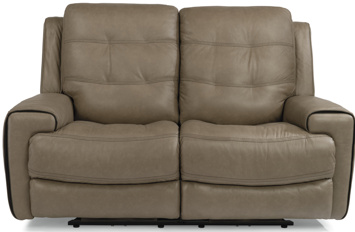
Leather Power Reclining Loveseat with Power Headrests 1681-60PH in Leather