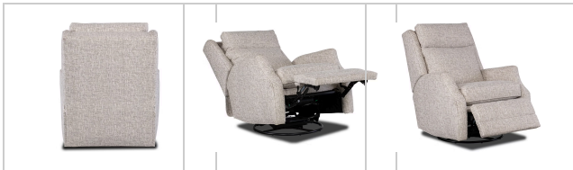
Fabric shown: 100268-12