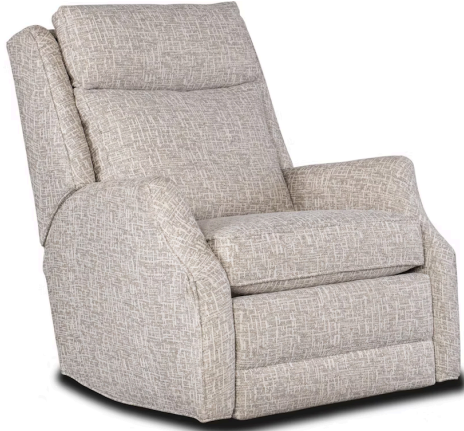
Fabric shown: 100268-12

Fabric: Hundreds of fabric options available.