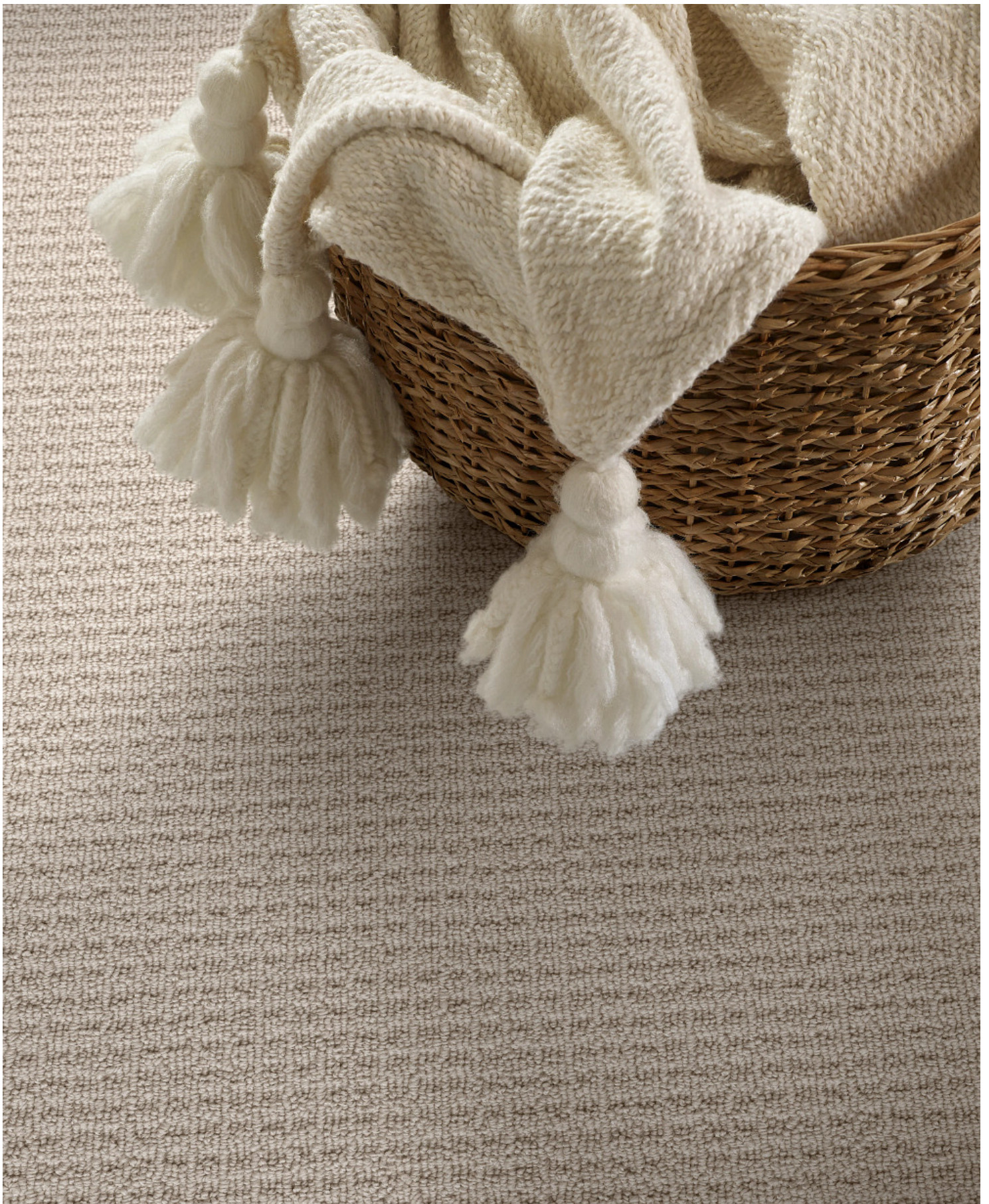
107 Natural Wood