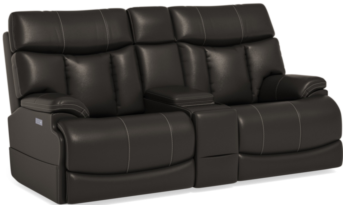
1594-64PH in Fabric 374-00