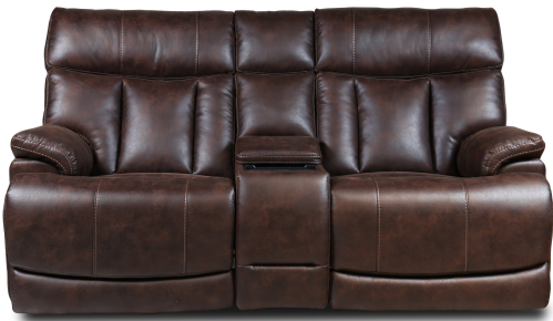
1594-64PH in leather 374-70