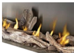
High definition driftwood