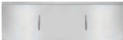
Stainless steel cover