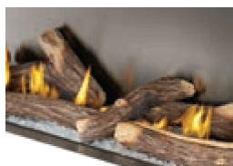
High definition oak