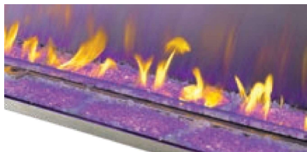
Ember bed and wind guard LED lighting with 7 colors: red, yellow, green, light blue, dark blue, purple, white