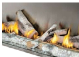
High definition birch