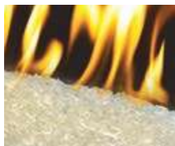
Glass beads & embers (amber, black, blue, clear, red, topaz)