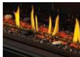
Woodland media kit