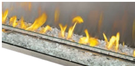
Clear glass embers