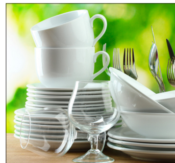
More dependable than condensation drying, our heating element is fast and efficient.

SHARP ELECTRONICS CORPORATION 100 Paragon Drive, Montvale NJ, 07645 1.800.237.4277 • www.sharppusa.com