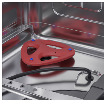
Place your most soiled pots and pans near the third sprayer for extra scrubbing power with Power Wash.