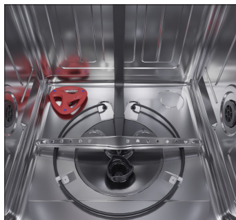
Durable Stainless Steel Tub.

The powerful and versatile features of this premium dishwasher give you more than peace of mind. The Sharp SDW6726MS also gives you peace and quiet at a serene 47dB, with the Library Quiet washing cycle. Balance and Harmony. Exceptional Quality. The SDW6726MS Stainless Steel Dishwasher from Sharp.