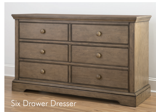
Six Drawer Dresser