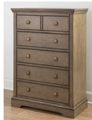
Five Drawer Chest