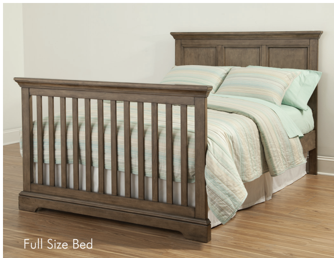
Full Size Bed